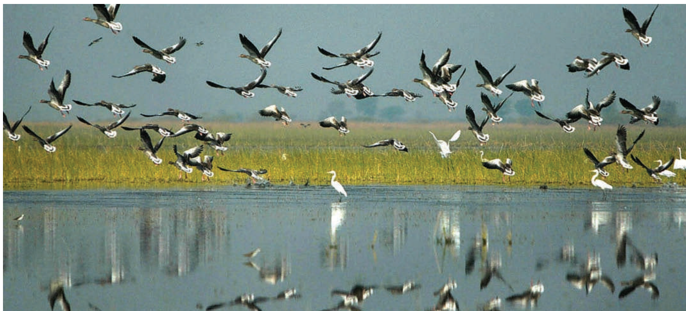
Figure 1 | Migrating greylag geese. Spring, and associated phenomena such as bird migrations, now occur earlier than at the start of the twentieth century. Stine and colleagues' data 4 quantify the seasonal shift.

One should also note the contrast between the enormous computational resources used by the models and the relatively meagre effort required to analyse real data. Thus, work of the type done by Stine et al. is to be applauded. Ignoring the time required to assemble the data and write the programs, it probably took no more than a few seconds of computer time to show effects that were not predicted by any of the models. As Richard Feynman commented, "It doesn't matter how beautiful your theory is, it doesn't matter how smart you are. If it doesn't agree with experiment, it's wrong."